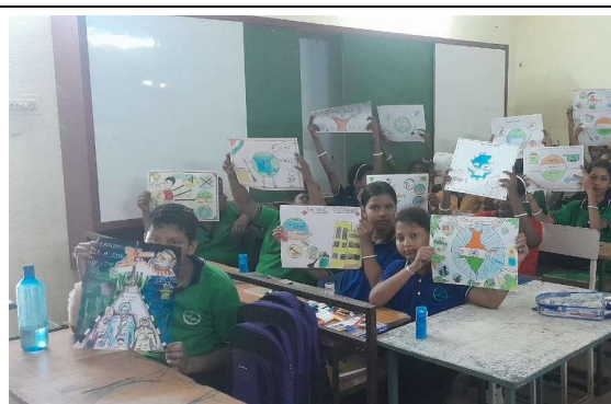
Students participating in drawing competition