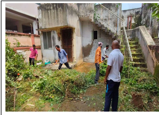
Cleanliness drive in Sailesh Vihar staff colony